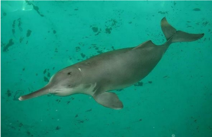
Chinese River Dolphin