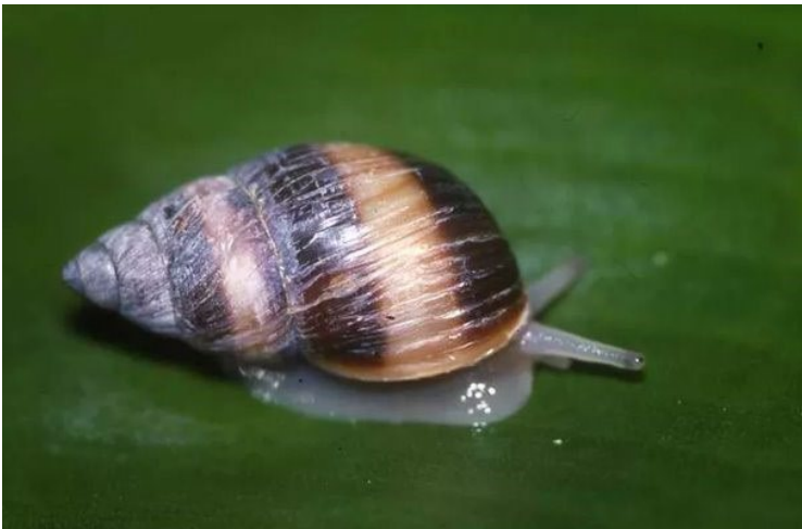
Moorean Viviparous Tree Snail— South Pacific