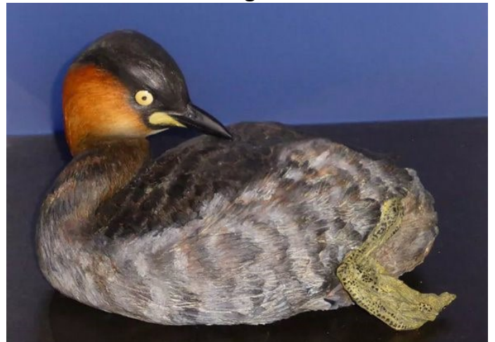
Alaotra Grebe— Madagascar