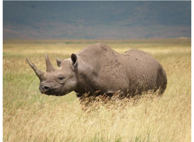
Black Rhino—southern Africa